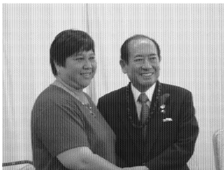
Meeting with Takaya Okayama mayors

Oct. 13 BDF plant, Tobu clean center and recycling plaza, Eco-technology Research Associate, Okayama city hall, Okayama University