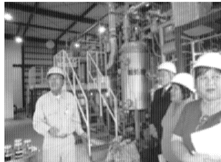
BDF plant of DOWA Ecosystem