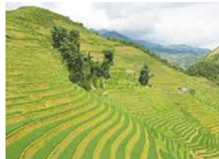
Terraced paddy fields in Sapa, Vietnam (photo on July 2011)

The commons are the cultural and natural resources accessible to all members of a community, which are not often managed by the "invisible hand" under a market system. It is the local community that uses the commons sustainably, and endogenous self-organization plays a crucial role in forming norms for sustainable resource exploitation. In this context, my research interests focus on rural communities in exploiting natural resources, with study areas including Japan, Korea, China, and Vietnam.